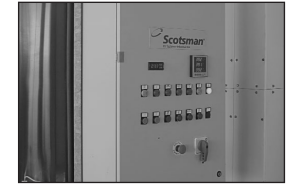
Scale Ice Makers Units