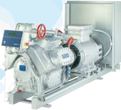
SMC 108 Rotatune

The Sabroe Rotatune reciprocating compressor concept is an innovative extension of the Sabroe reciprocating compressor range to include a series with variable speed drive.